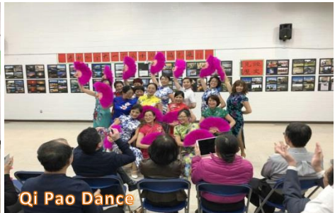
Traditional Chinese Tai-chi, Tai-chi Fan and Qi-pao dance performed by OCCSC members at the award ceremony

The photo exhibition has been a complete success!