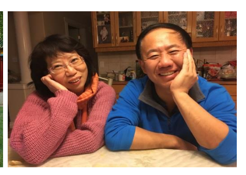
Harmonious life (Winning Photos)