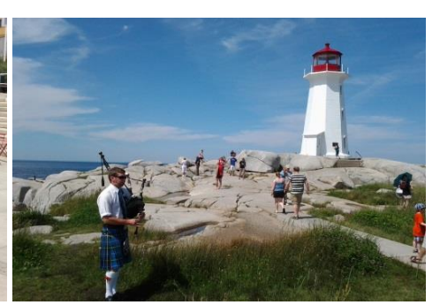
History (Winning Photos)